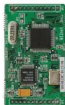
Ethernet Module (IIM7100A Module)